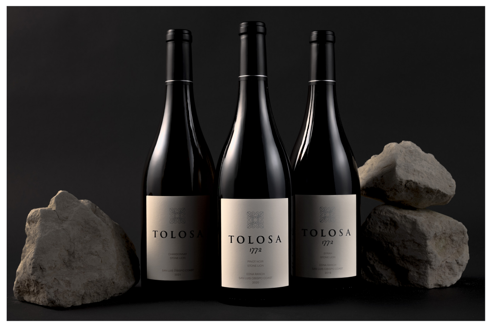
ABOUT OUR 1772 CLUB: MAY RELEASES

The Stone Lion series of wines hang on the vine a little bit longer to develop a richer and riper profile. Extended aging in mostly New French Oak gives this style a richer mouthfeel on the palate. These wines are named after the Stone Lion statue discovered in the Moretti section of Tolosa's Estate Vineyard, Edna Ranch. Indulge in the bold expression of the San Luis Obispo Coast through this curated lineup of Burgundian influenced wines.